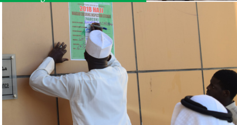
Pasting of Sticker after inspection of catering companies ahead of 2018 Hajj operations