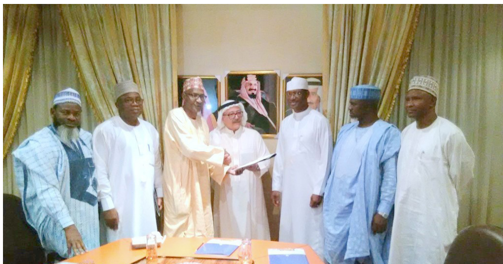
Chairman of United Agents Office in a handshake with the Nigerian Ambassador to Saudi Arabia after signing of Service Agreement of the 2018 Hajj

He added that the board had met over the development and resolved to embark on public enlightenment in collaboration with the state's Muslim Council "to ginger the intending pilgrims to expedite payment."