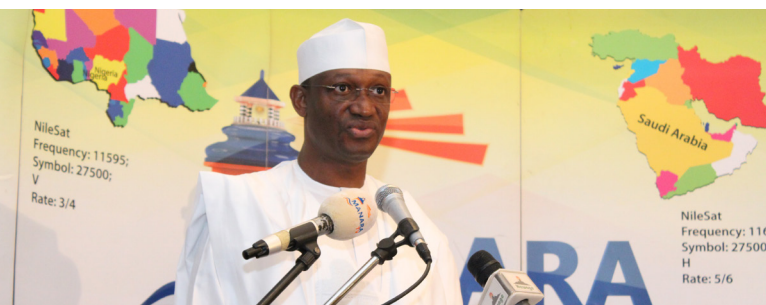
Chairman/CEO delivering his keynote address at one day symposium organized by Manara TV